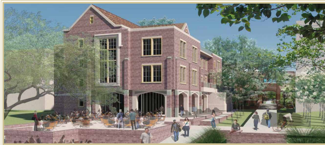
Artist rendering of the prospective Honors, Scholars, and Fellows House on Landis Green. To learn more, visit honors.fsu.edu .

Mark your calendar! Freshmen Honors students traditionally kick off the school year with a big welcome event where they convene to enjoy good food and good music. In addition, there's the annual Fall Ice Cream Social and the student talent showcase at the Honors Coffee House.